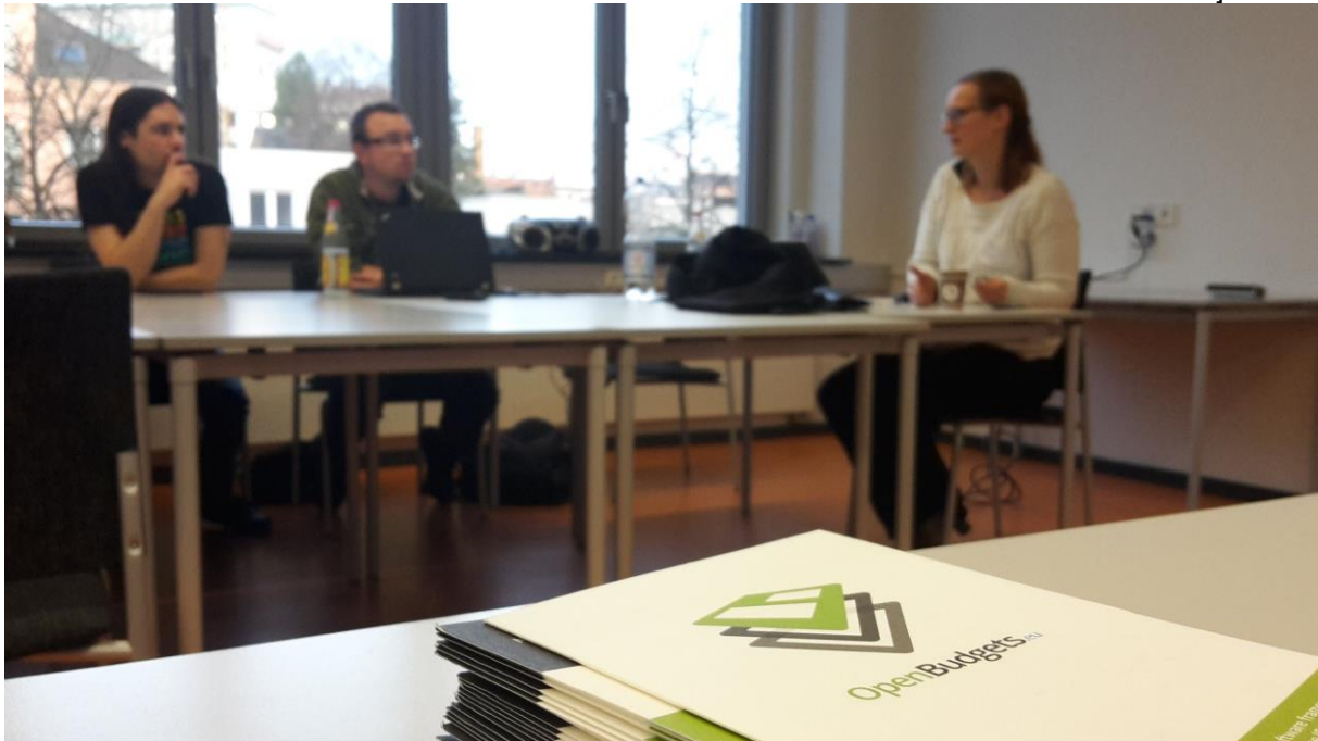
Fig. 2: Open Budgets at 'Offene Kommunen NRW'

International Open Data Conference 5 : The IODC is one of the largest and most important open data conferences worldwide. During the conferences, the OpenBudgets.eu project and the call for tender were presented in a talk as well as several face-to-face conversations. Social media 6 was used to broaden the audience and further disseminate these messages.